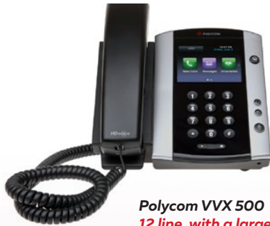
Polycom VVX 500 12 line, with a large color screen – perfect for executives