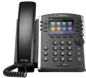
Polycom VVX 400 12 line, color screen – a terrific mid-range device