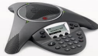
Polycom IP 6000 Premium conference room phone – ideal for mid-sized applications

ACT features Polycom IP phones to power your business. Polycom is known industry-wide for its superior voice quality and handset design.